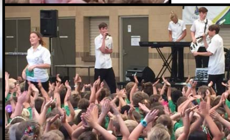
Term 4 Makybe Magic Kids